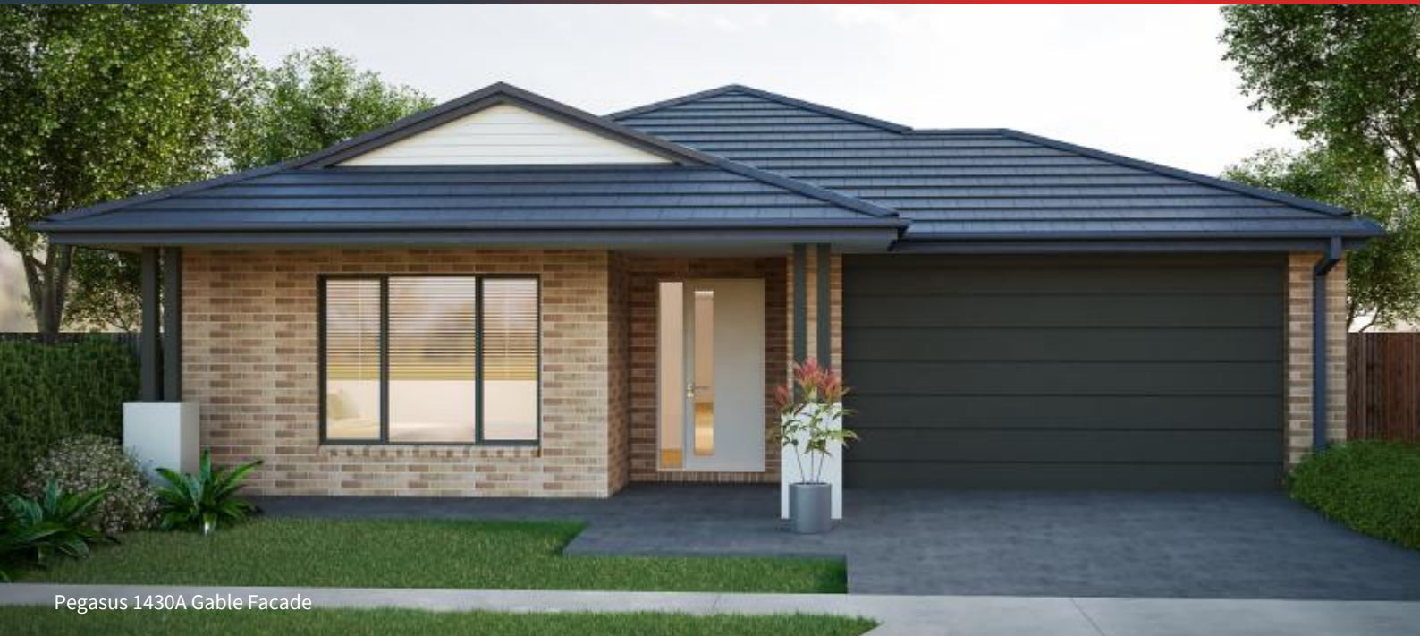
Pegasus 1430A Gable Facade

LOT 144 SUNLIT CLOSE, BARLOW HILLS, EPSOM